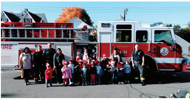
Action Early Learning Center students celebrating Touch-A-Firetruck day in March 2021